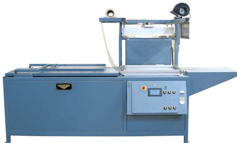
ASP/IR with Automated In-feed